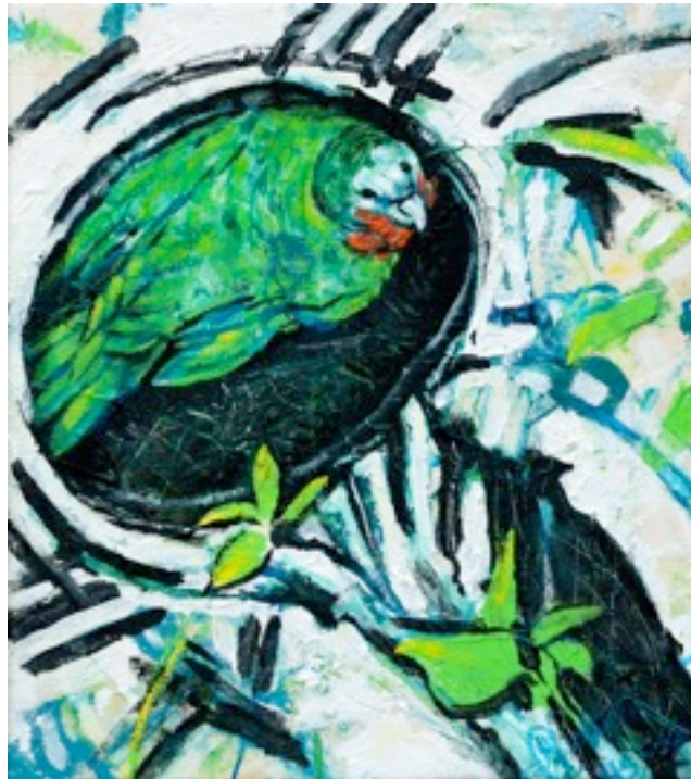
Studies of Nesting Sites 15" x 17" each Acrylic on Canvas From the collection of Dawn Davies