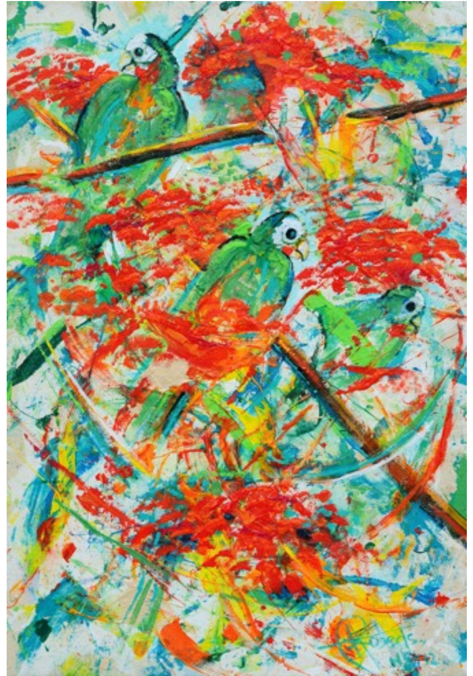
* Celebration 22" x 32" each Acrylic on Canvas