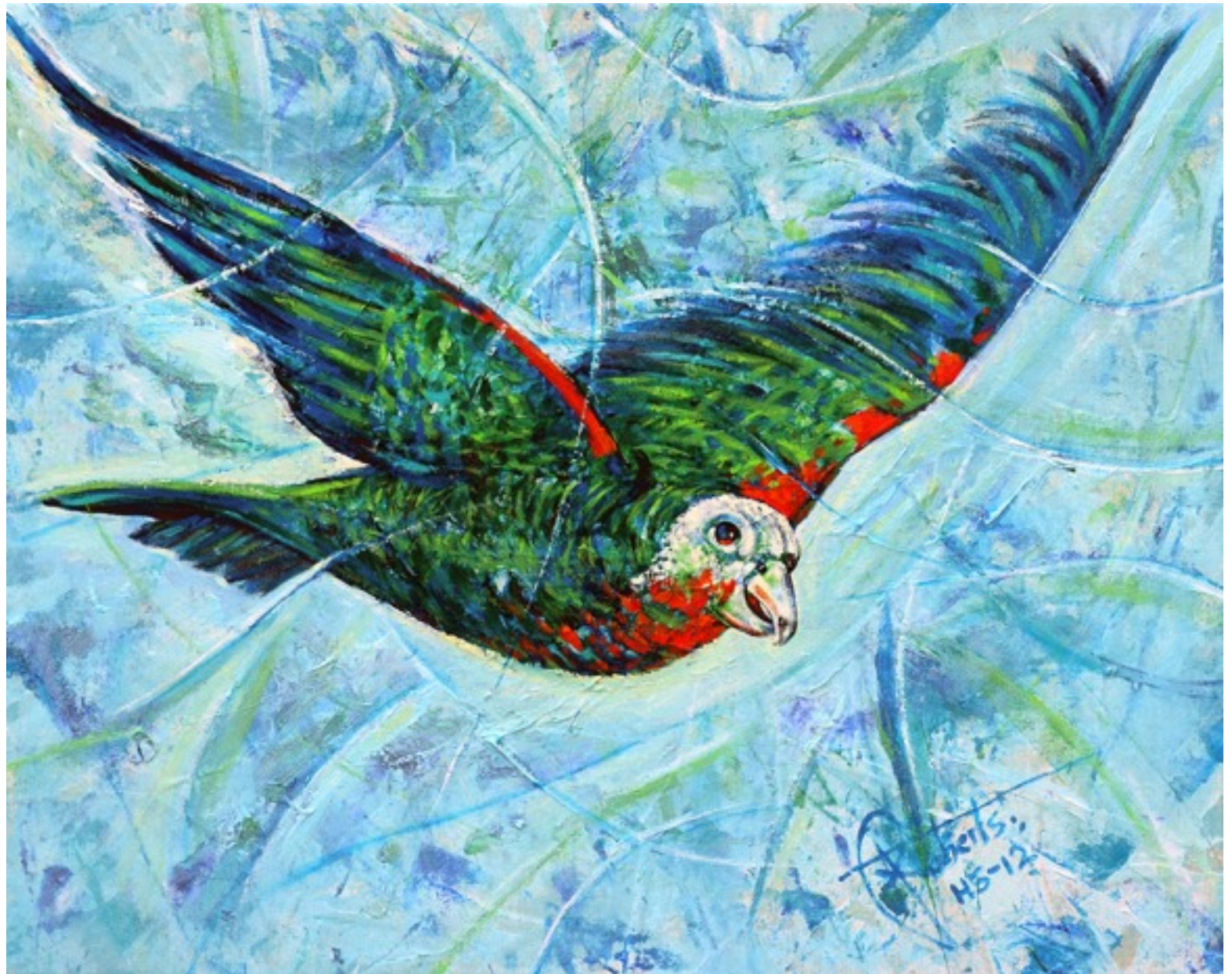
* Day Break 32" x 40" Acrylic on Canvas