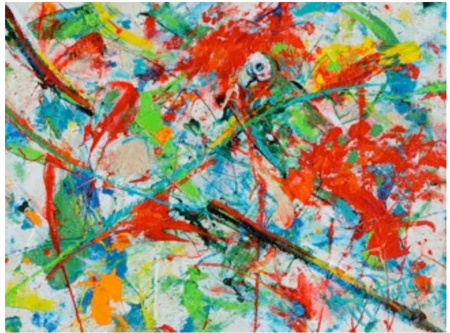
Studies of Celebration 15" x 20" each Acrylic on Canvas