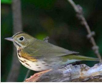
OVENBIRD Seiurus aurocapilla WR 1