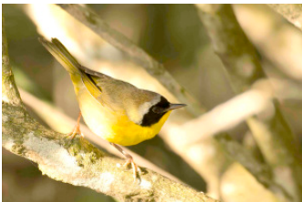
COMMON YELLOWTHROAT Geothlypis trichas WR 1