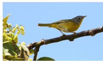
NASHVILLE WARBLER Oreothlypis ruficapilla WR 4