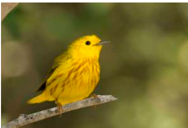
YELLOW WARBLER Setophaga petechia PR B 1