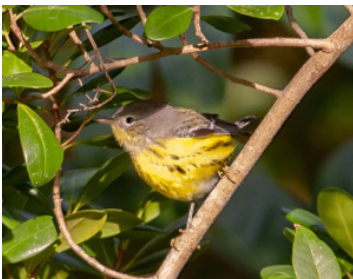
MAGNOLIA WARBLER Setophaga magnolia WR 3