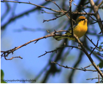
BLUE-WINGED WARBLER Vermivora cyanoptera WR 3