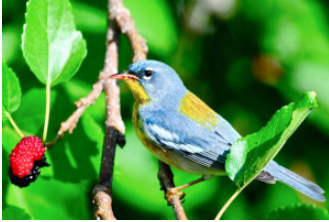
NORTHERN PARULA Setophaga americana WR 1