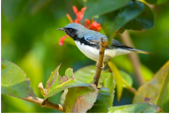
BLACK-THROATED BLUE WARBLER Setophaga caerulescens WR 2