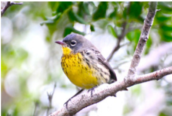
KIRTLAND'S WARBLER Setophaga kirtlandii WR 4