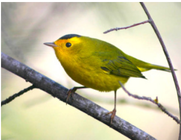
WILSON'S WARBLER Cardellina pusilla TR 4