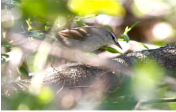
SWAINSON'S WARBLER Limnothlypis swainsonii WR 4