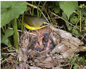
KENTUCKY WARBLER Geothlypis formosa TR 4