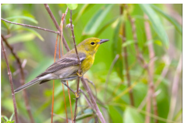
PINE WARBLER Setophaga pinus PR B 1