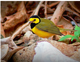
HOODED WARBLER Setophaga citrina WR 3