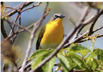
YELLOW-BREASTED CHAT Icteria virens

PHOTO CREDITS (1 - 37) Bruce Hallett (Header, 3, 9, 12, 14, 17, 21, 22); Tom Reed (1, 4); Tom Sheley (2, 7, 10); Alex Hughes (5); Gerlinde Taurer (6, 11, 18); Becky Marvil (8); Woody Bracey (13, 24); Peter Mantle (15); RH (16); William H. Majoros wiki (19); talainsphotographyblog (20, 26, 34); Charmaine Albury (23); Craig Nash (25); Ann Capling (27); Jerry Oldenettel wiki (28); Dominic Sherony wiki (29); 1000obirds (30); Steve Maslowski wiki (31); MDF wiki (32, 33); Avibirds (35); Michael Woodruff wiki (36); Emily Willoughby wiki (37)