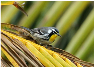
YELLOW-THROATED WARBLER Setophaga dominica WR 1