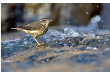
LOUISIANA WATERTHRUSH Parkesia motacilla WR 3