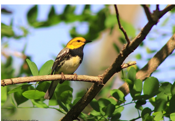
BLACK- THROATED GREEN WARBLER Setophaga virens WR 3