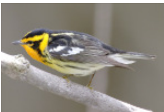
BLACKBURNIAN WARBLER Setophaga fusca TR 4