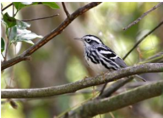
BLACK-AND-WHITE WARBLER Mniotilta varia WR 2