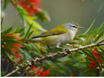
TENNESSEE WARBLER Oreothlypis peregrina TR 4