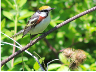
CHESTNUT-SIDED WARBLER Setophaga pensylvanica TR 4