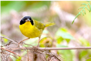
BAHAMA YELLOWTHROAT Geothlypis rostrata PR B 1 ENDEMIC