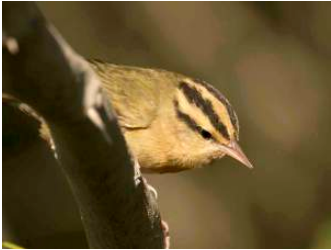
WORM-EATING WARBLER Helminthos vermivorum WR 2