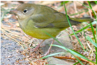
CONNECTICUT WARBLER Oporonis agilis TR 4