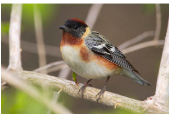
BAY-BREASTED WARBLER Setophaga castanea TR 4