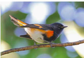
AMERICAN REDSTART Setophaga ruticilla WR 1