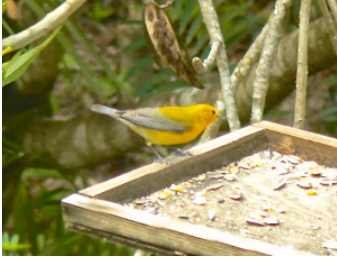
PROTHONOTARY WARBLER Protonotaria citrea TR 3