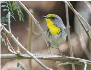
OLIVE-CAPPED WARBLER Setophaga pityophila PR B 1