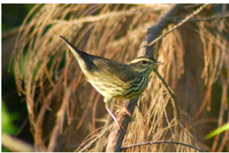
NORTHERN WATERTHRUSH Parkesia noveboracensis WR 1