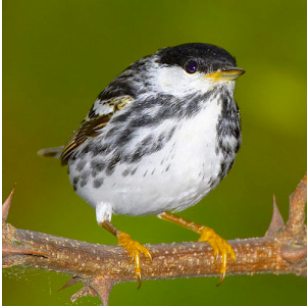
BLACKPOLL WARBLER Setophaga striata TR 3