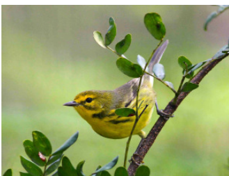
PRAIRIE WARBLER Setophaga discolor WR 1