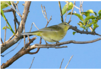
ORANGE-CROWNED WARBLER Oreothlypis celata TR 4