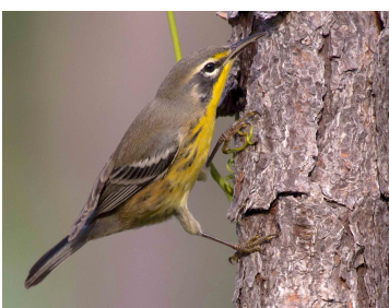
BAHAMA WARBLER Setophaga flavescens PR B 1 ENDEMIC