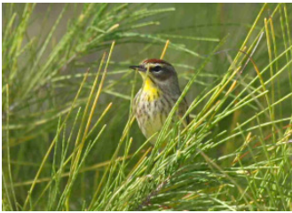
PALM WARBLER Setophaga palmarum WR 1