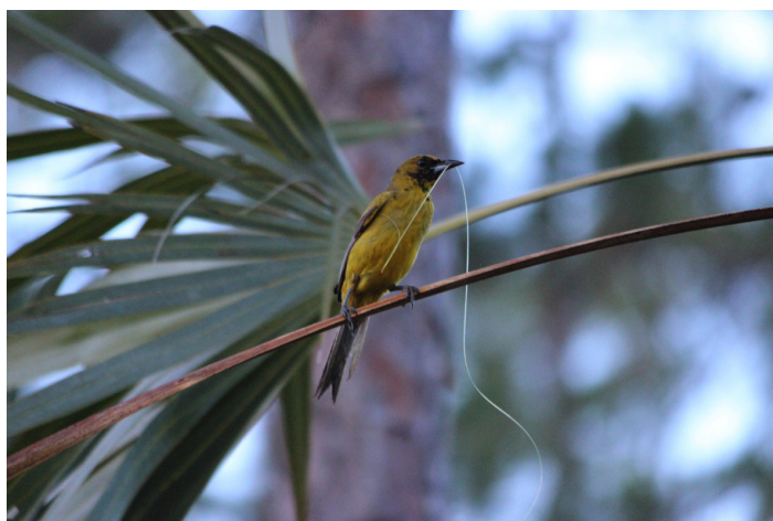
Fig. 3. SY Bahama Oriole carrying a palm frond fiber as nest building material. This likely female was constructing a nest in an understory Key thatch palm within a pine forest.